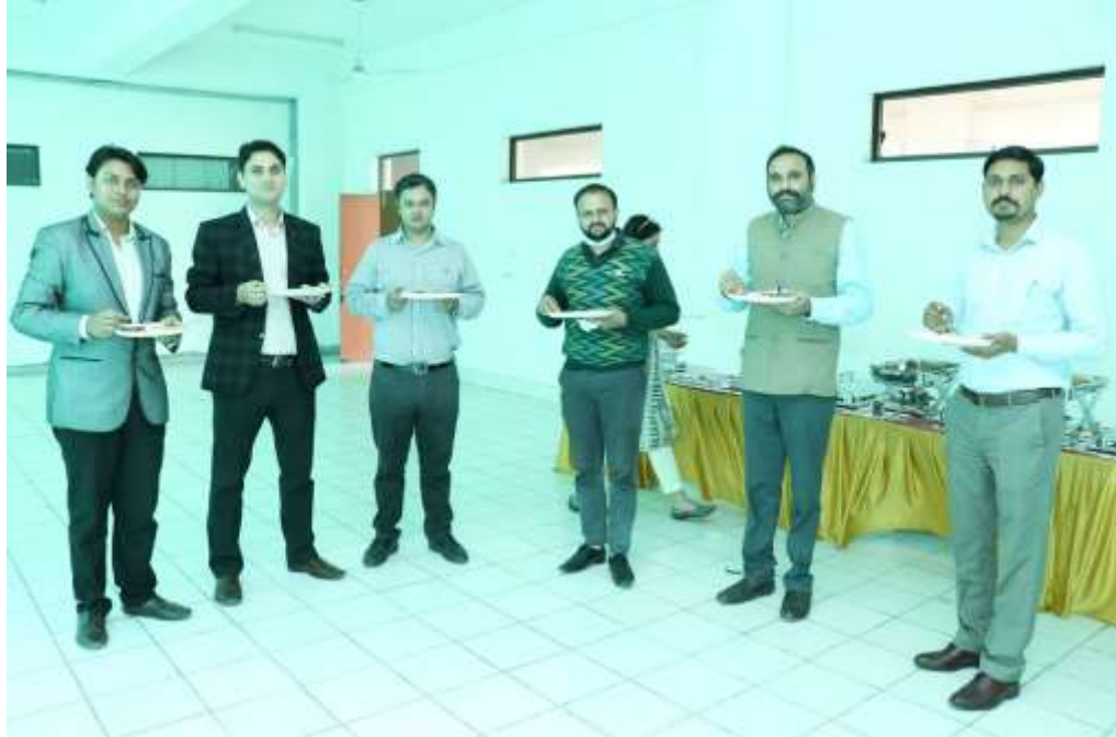
GATHERING FOR LUNCH IN THE CENTRAL LIBRARY