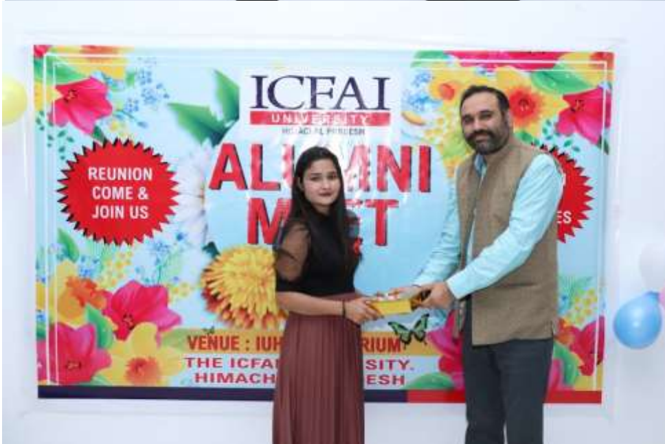
GIFTS DISTRIBUTION CEREMONY