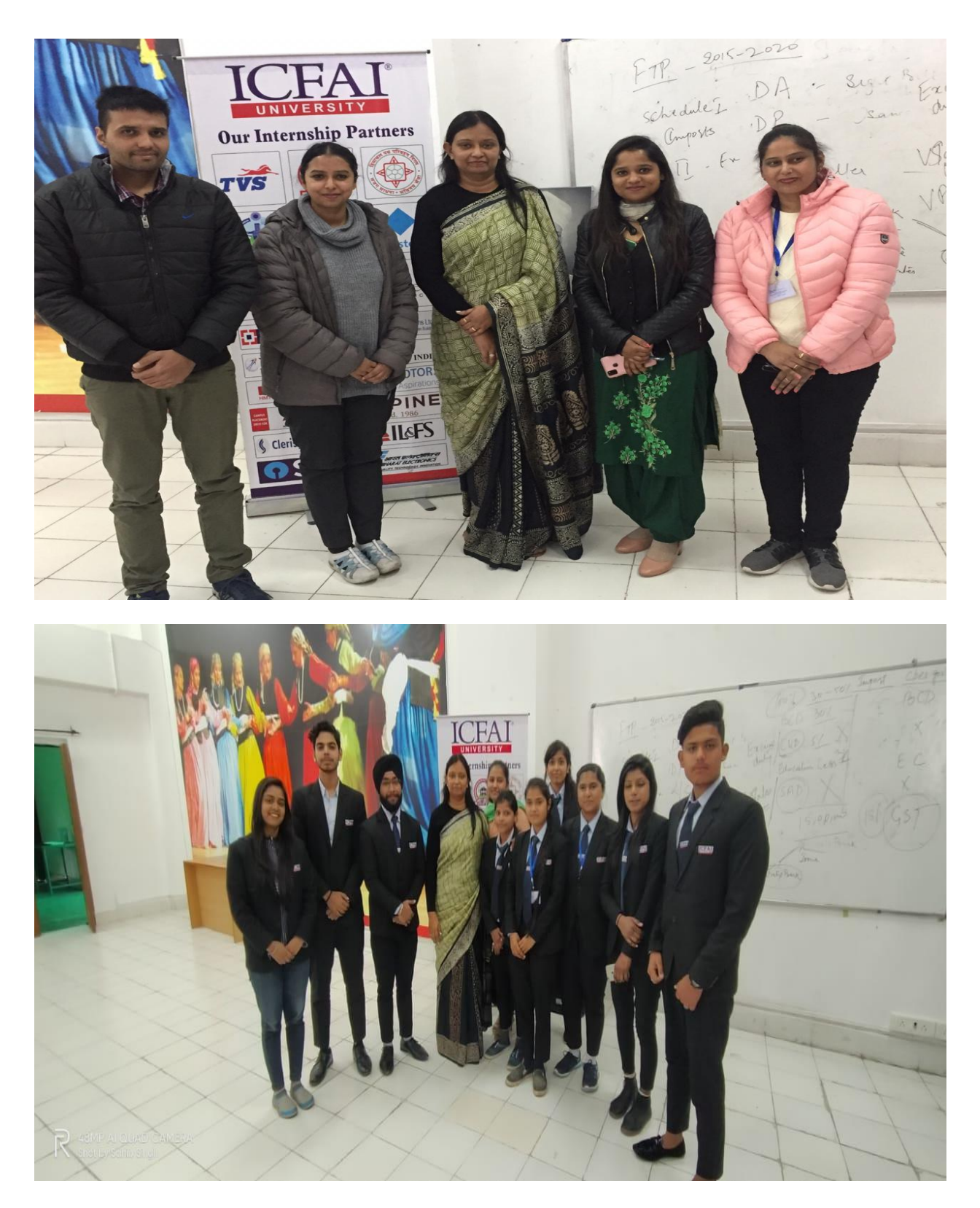
Experts with Faculty and participants